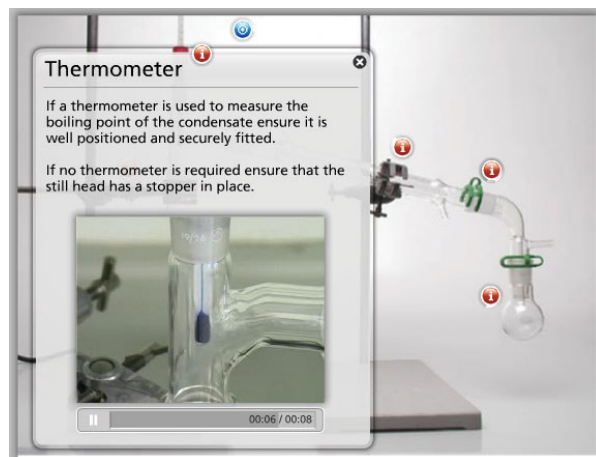
Figure 2 'Clickable' images explain safety and how to set up equipment correctly

There are interactive simulations for setting up and optimising experiments within the software for the standard practical techniques. Figures 1-4 give a flavour of the simulations that allow students to develop their understanding of techniques in a safe environment that does not result in a big glassware replacement bill for practices that go wrong. Interactive videos (Fig 5) for each technique are included to further prepare students for the practical work ahead of them.